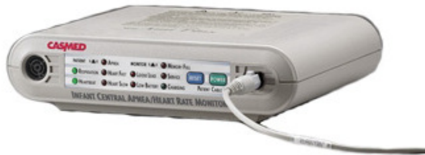
CASMED AMI® Plus Cardiorespiratory Infant Apnea Monitor

If you are interested in our AMI® Plus Recertification Program, please contact CASMED Customer Support for current pricing and to set up an RMA for return