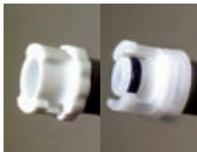
MQMF (MQ + MQML)